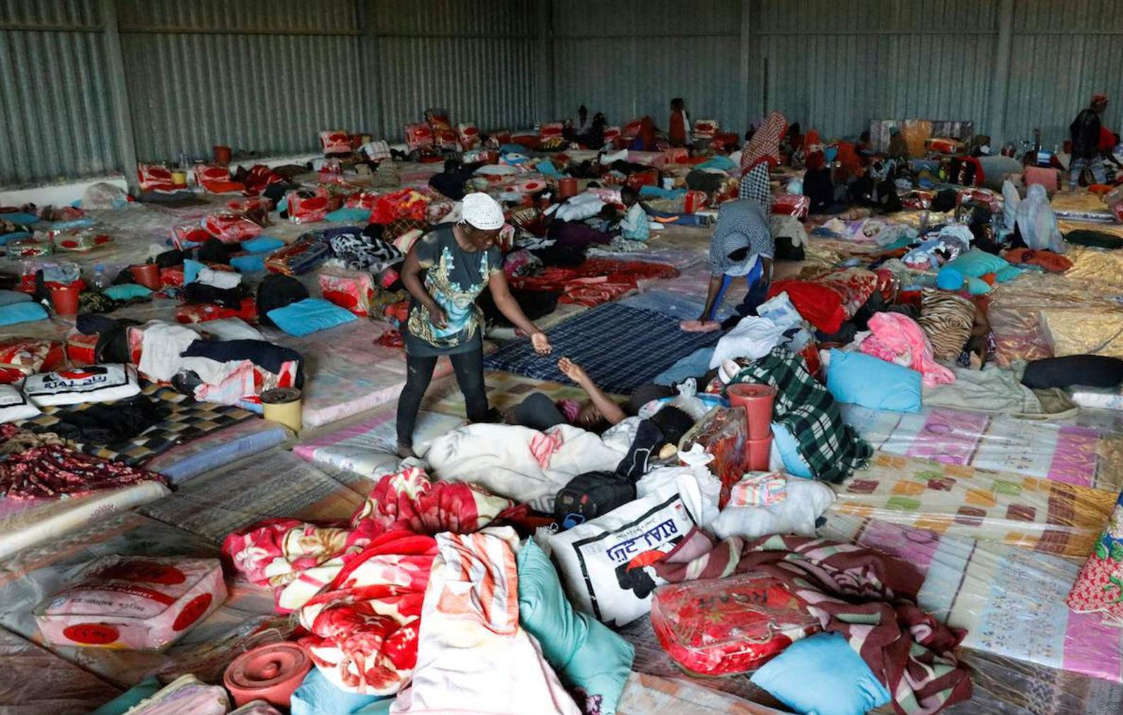
Migrants are held in a detention centre in the coastal city of Sabratha, Libya. 9 October 2017.

foreign detainees were convicted on immigration related grounds or for other offences). 73