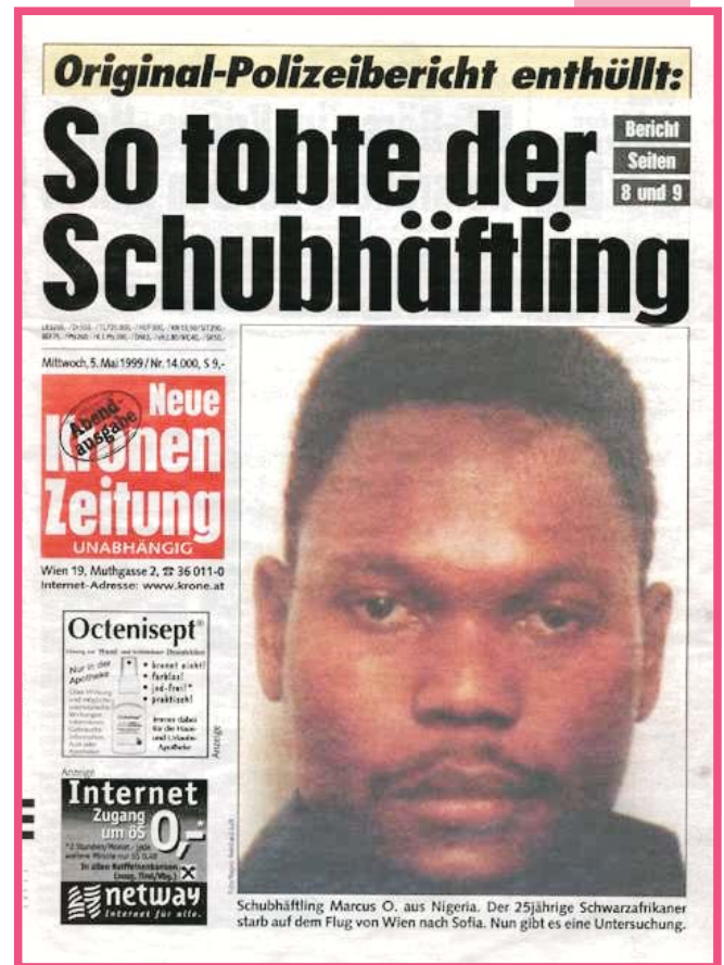
"Kronen Zeitung" May 5, 1999